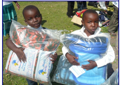
Children with their new blankets

PsP continues to support 34 pre-schools across Harare, in partnership with local churches, impacting over 1500 children every year. We have had donations of toys and blankets which the pre-schools are making good use of, and a new funding arrangement with Children First is also allowing the team to purchase much-needed extra resources for the schools.