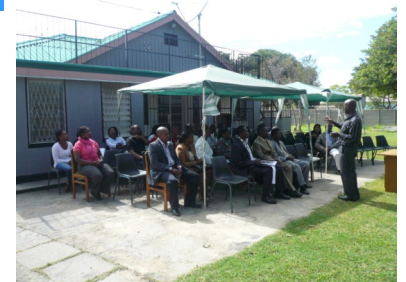
Presentation to church partners at the Oasis offices

The team have held a number of vision conferences and follow-up meetings with church pastors, and run training sessions on resource mobilization, project management and small grants distribution.