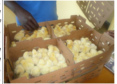
Day-old chicks for the income-generating poultry project

that we already have a start, we already have capacities, talents and direction as members of our group. We have managed to maximize the opportunity that had knocked at our door. And one thing that put the drive in us is that we have a vision and a legacy that need to be left in our community. We have gone through certain challenges such as discouragement, frustration and being despised, but we have endured and followed through until it happens.”