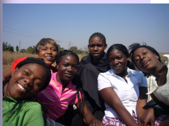
Skills Training girls going to visit a bead-making project