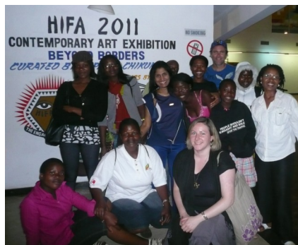
Some of our staff members and volunteers with Tanaka Girls at the Harare International Festival of Arts, April 11